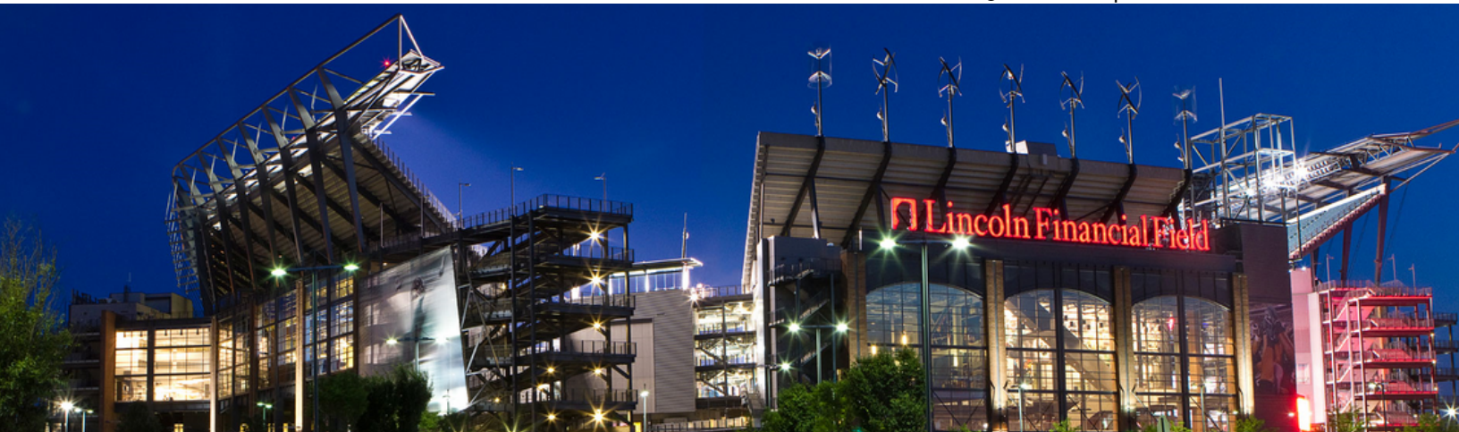
Lincoln Financial Field, home of the 2019 Green Sports Alliance Summit